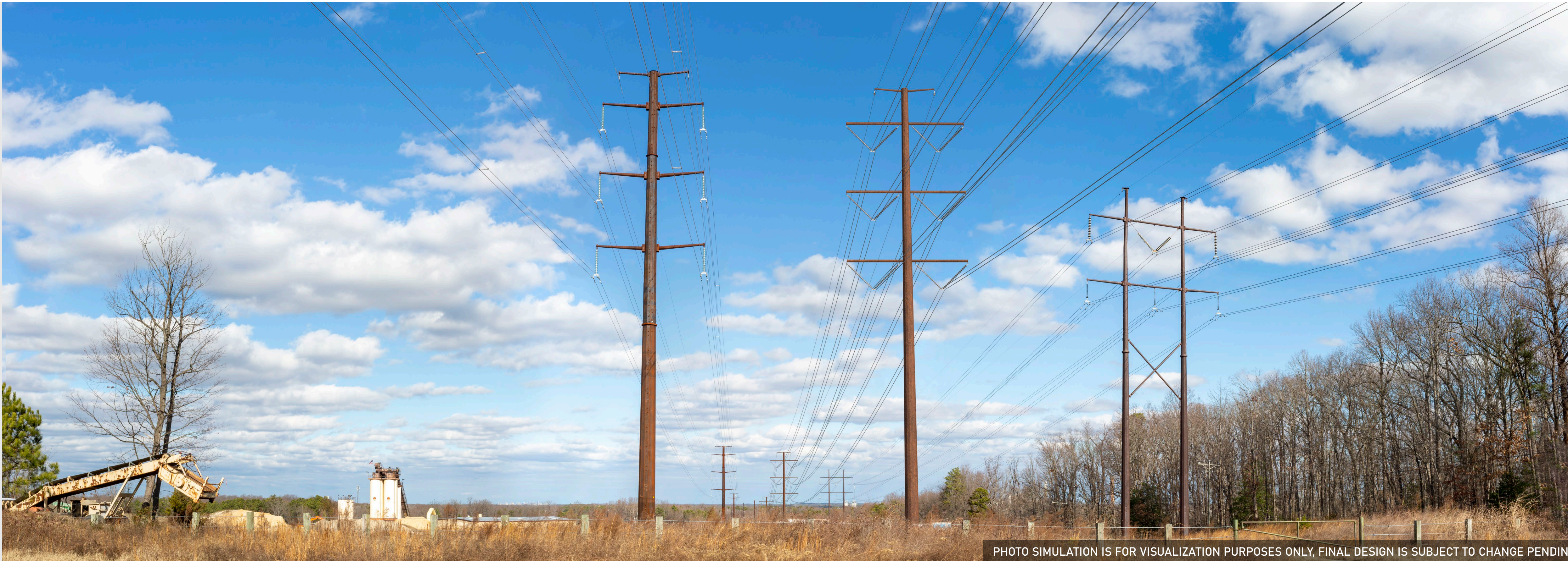
PHOTO SIMULATION IS FOR VISUALIZATION PURPOSES ONLY, FINAL DESIGN IS SUBJECT TO CHANGE PENDING PUBLIC, ENGINEERING, AND REGULATORY REVIEW.