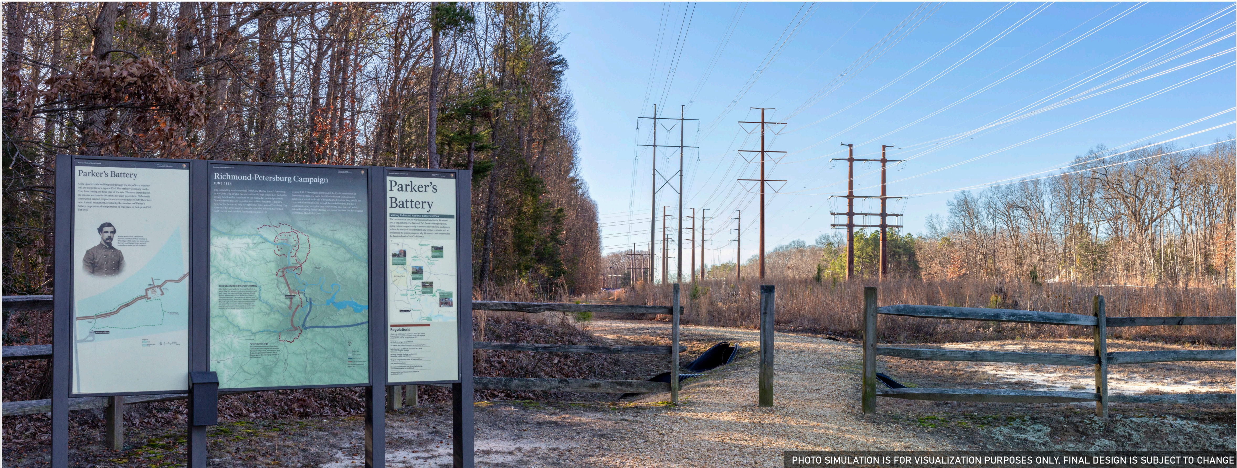
PHOTO SIMULATION IS FOR VISUALIZATION PURPOSES ONLY, FINAL DESIGN IS SUBJECT TO CHANGE PENDING PUBLIC, ENGINEERING, AND REGULATORY REVIEW.